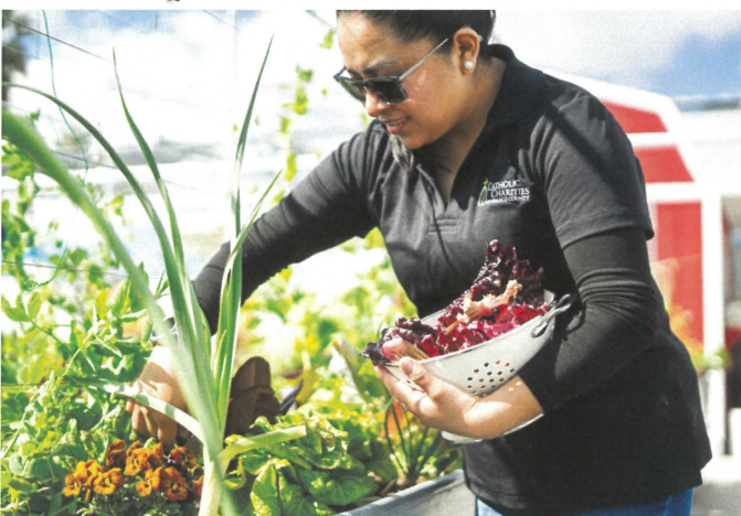
The Garden of Hope provides both nutritious food and educational opportunities for the community.