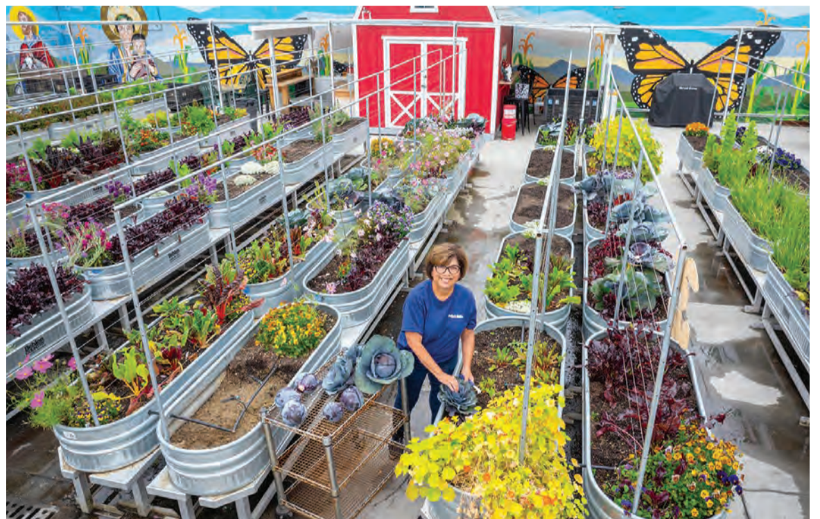
Garden of Hope, Catholic Charities of Orange County

For more information about our philanthropic opportunities, please contact philanthropy@ccoc.org