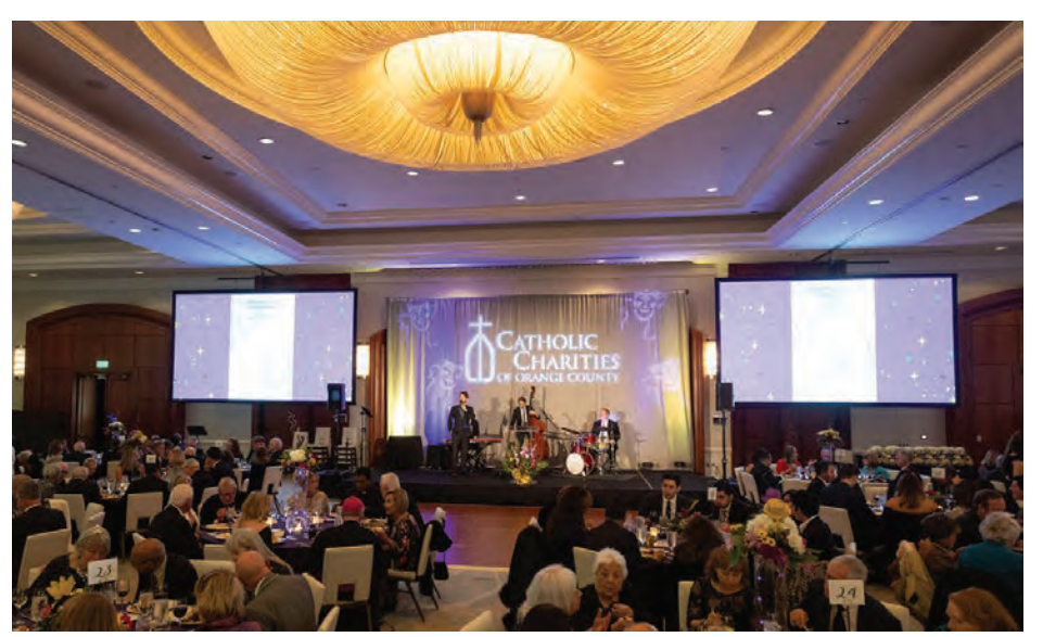
35th Mardi Gras Gala - Catholic Charities of Orange County