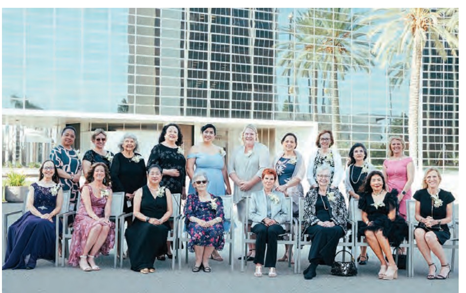
Friday, May 10, 2024 | 2024 Inspirational Catholic Women Nominees, Christ Cathedral, Garden